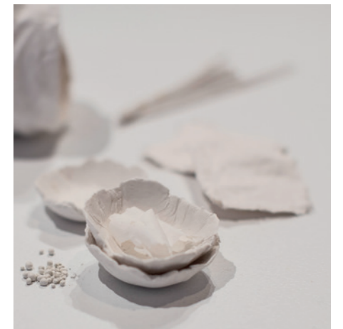
Below: Lynda Wilson Moths drink the tears of sleeping birds clay, cotton thread 2018